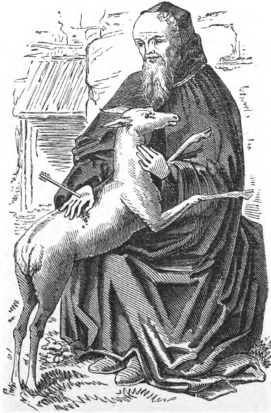
S. Giles ( Lucas van Leyden ).

of St. Giles. The reason why he was chosen by the Queen to give a name to her undertaking tells us something of his character. He was renowned as the patron saint not only of lepers, but of cripples and beggars, "of all driven by